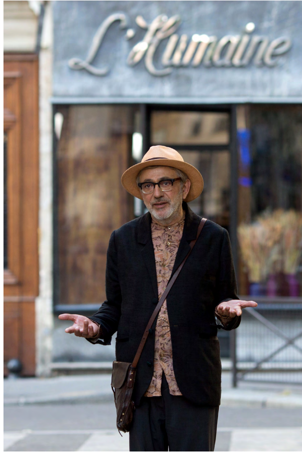
It Must Be Heaven by Elia Suleiman Coproductioin France, Québec, Germany, Turkey